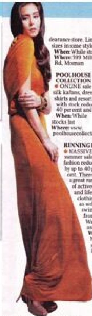
Elaine dress, was $270, now $200, from Gosh Celebrity Fashion

SAVE 50 per cent on a range of fashion items at the Mowman