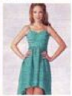
Ladakh Labyrinth dress, was $179, now $88.95, from www.theiconic.com.au

When: 305/51 Marlborough St, Surry Hills, (02) 9330 3953