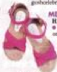
Women's espadrilles, was $54.95, now $45, from Jones

CELEBRATE the Oscar and red carpet season by saving $20 off any Fla-Gla Perry dress. Enter the code "GCF20" at checkout to see the discount. When: Until Wednesday When: www.goshcelebrity.com