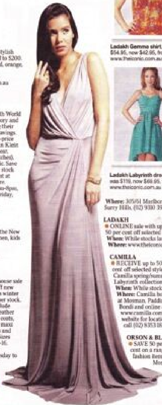
Bridgette dress, was $385, now $345, from Gosh Celebrity Fashion